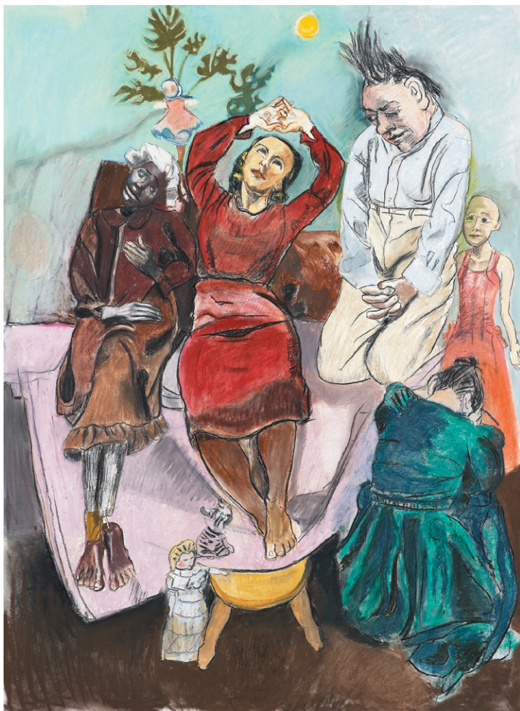
Therapy , 2011