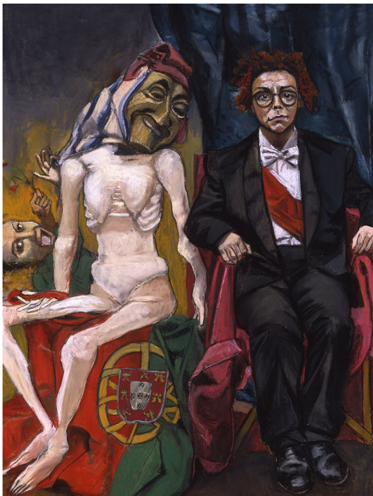
The Old Republic, 2005