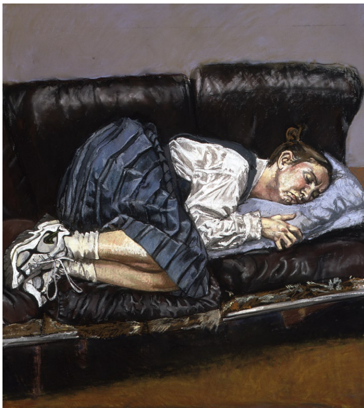
Abortion series, Untitled no. 4, 1998