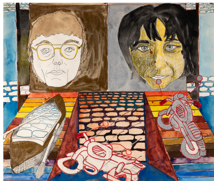
Dream Painting , 1976 Felt tip pen, oil crayon, watercolour on paper, 35,5 x 42,5 cm