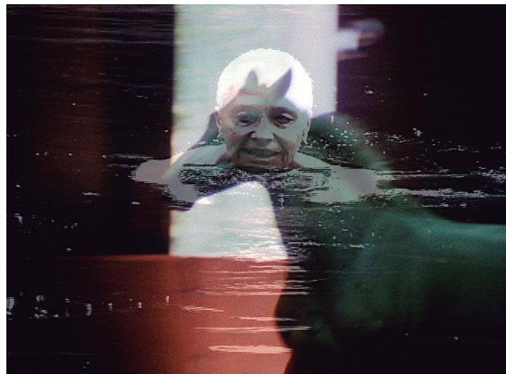
A Horse is Not a Metaphor, 2008 16 mm film on video