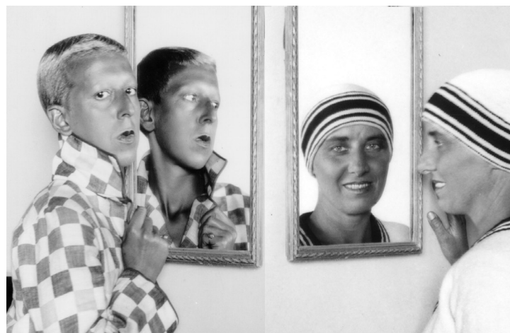
Lover Other, 2006 16 mm film on video