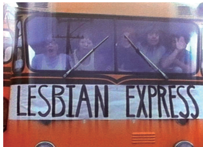
Superdyke , 1975 16 mm film on video

The other works have the same questioning tone. They are self-portraits in a less literal version, jumping from one period to another, from one medium to another, from poetry to philosophical aphorism, from humour to transcendence. They challenge the clichés with which women are represented and ask questions about an identity in the process of affirmation or denial.