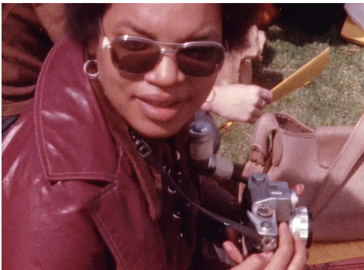
Sisters!, 1973 16 mm film on video