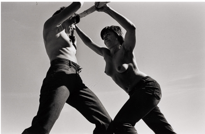
Wrestling, Hornby Island, British Columbia, 1972 Silver gelatin print, 27,30 x 21,59 cm