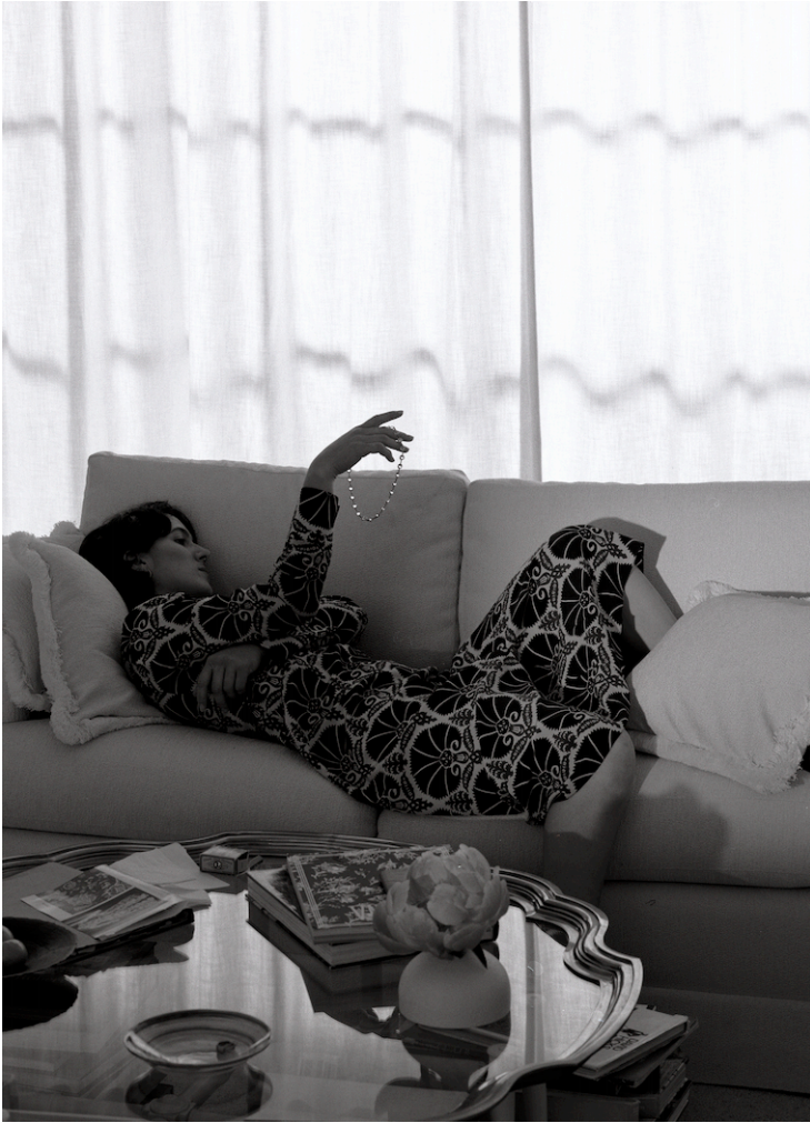
A Woman with a necklace (detail), 2021. Silver gelatine print.