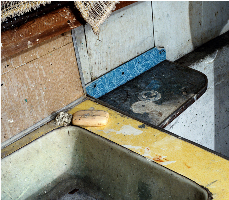
Diagonal Composition , 1993. Transparency on lightbox, 40 x 46 cm. © Jeff Wall.