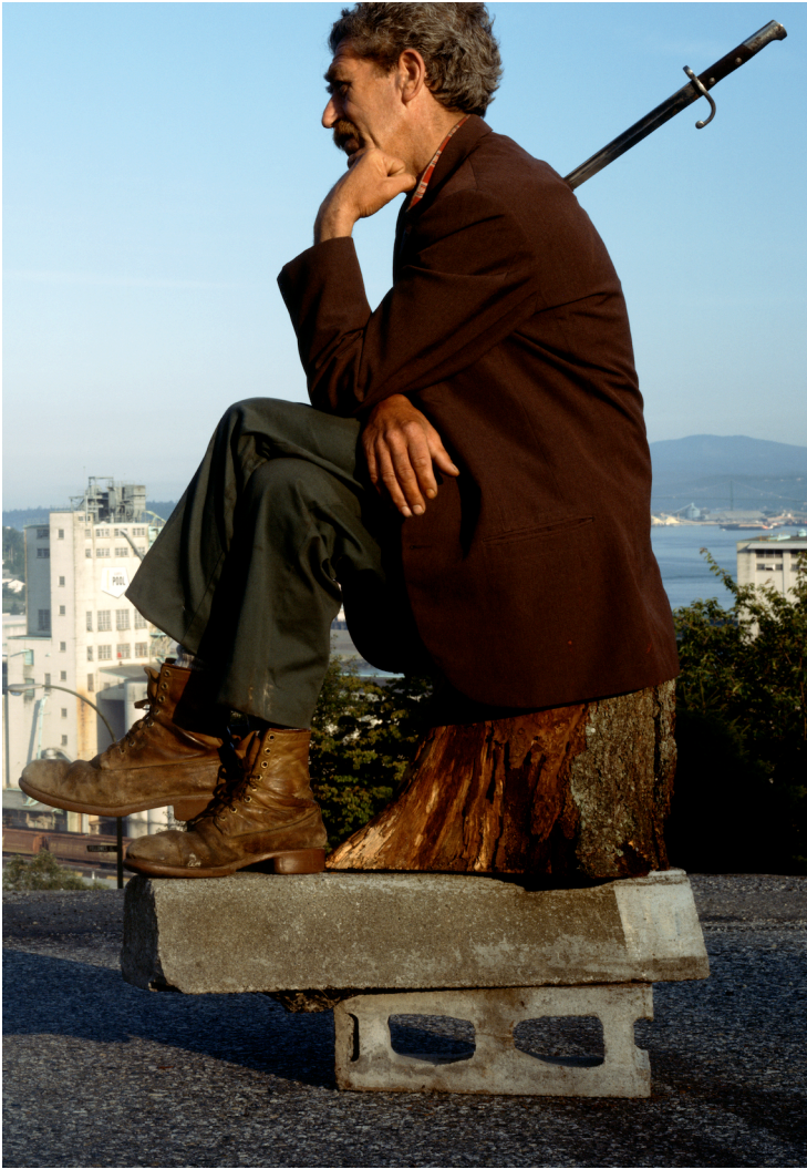
The Thinker (detail), 1986. Transparency on lightbox. © Jeff Wall.