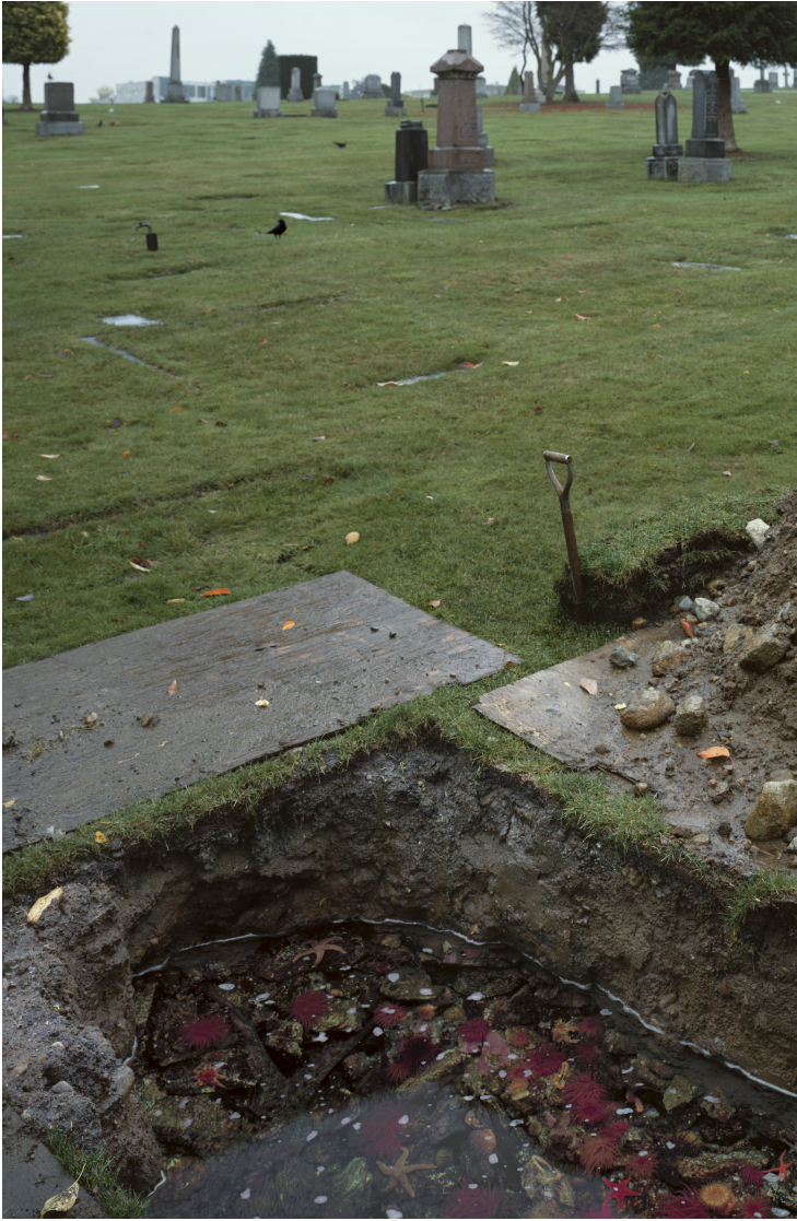
The Flooded Grave (detail), 1998-2000. Transparency on lightbox.