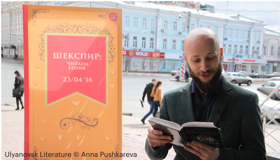
Ulyanovsk Literature

Crafts & Folk Art / Design / Film / Gastronomy / Literature / Music / Media Arts