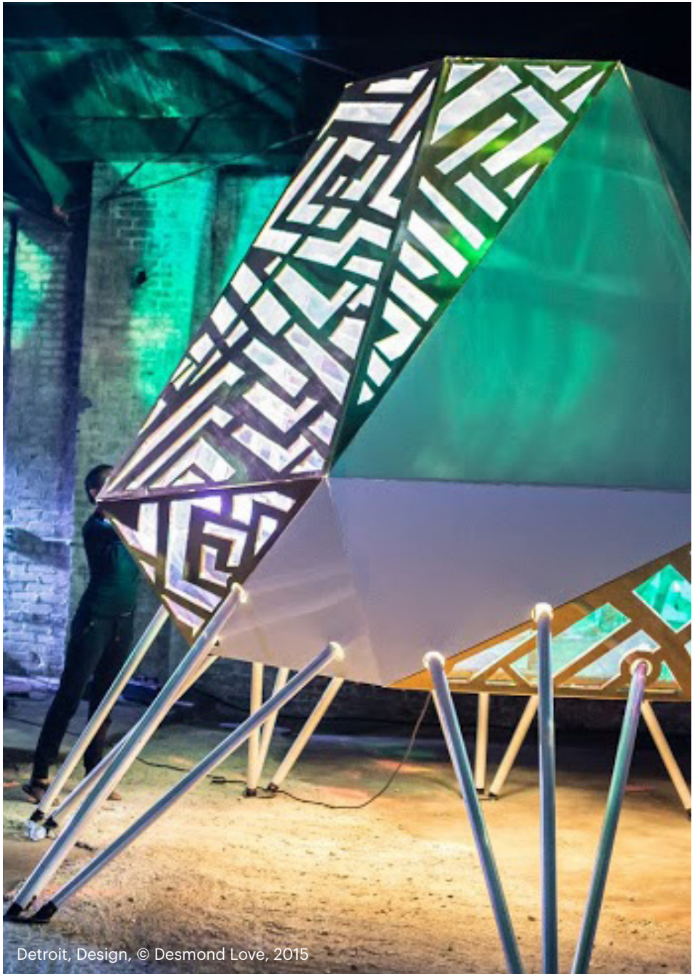
Detroit, Design, © Desmond Love, 2015