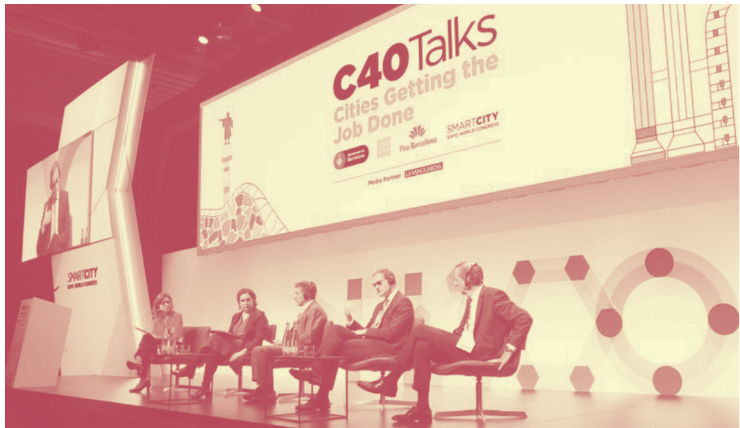
Mayor Ada Colau during the gathering "C40 Talks: Cities Getting the Job Done". November 2018.

One should also mention relations with the network Local Governments for Sustainability (ICLEI); in particular, for example, the City Council's involvement at the world Congress held in Montreal in 2018, at which Barcelona presented innovative projects focused on guaranteeing the right to a healthy and sustainable city.