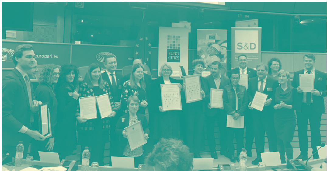
Deputy Mayor Laia Ortiz at the presentation of the commitments made to the European Pillar of Social Rights at the European Parliament. February 2019.

Meanwhile, Barcelona played an active role at the mayoral summits on the future of Europe organised by the Eurocities network in March 2017 and 2019, focusing at all times on social rights. The first summit marked the launch of a series of initiatives intended to reflect on Europe's future from the local perspective, highlighting the contribution made by cities in building the continent