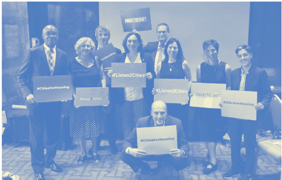
Mayor Ada Colau together with other mayors at the presentation of “Cities for Adequate Housing” in New York. July 2018.

Meanwhile, the Department of International Relations has supported the City Council’s efforts to ensure that the right to housing is given importance at the European level, in particular through the Eurocities network, with the mayor playing a key role at the organisation’s second mayoral summit (March 2019), at which she set out specific and urgent housing measures. Of similar importance is Barcelona’s involvement in forums such as “Housing for All” in Vienna (December 2018), its commitment to the European Pillar of Social Rights, specifically with regard to access to housing, and the city’s hosting of the seminar “Promoting the Right to Housing at the EU Level: challenges and policy proposals” (March 2019), organised by CIDOB with the collaboration of UCLG and the City Council.