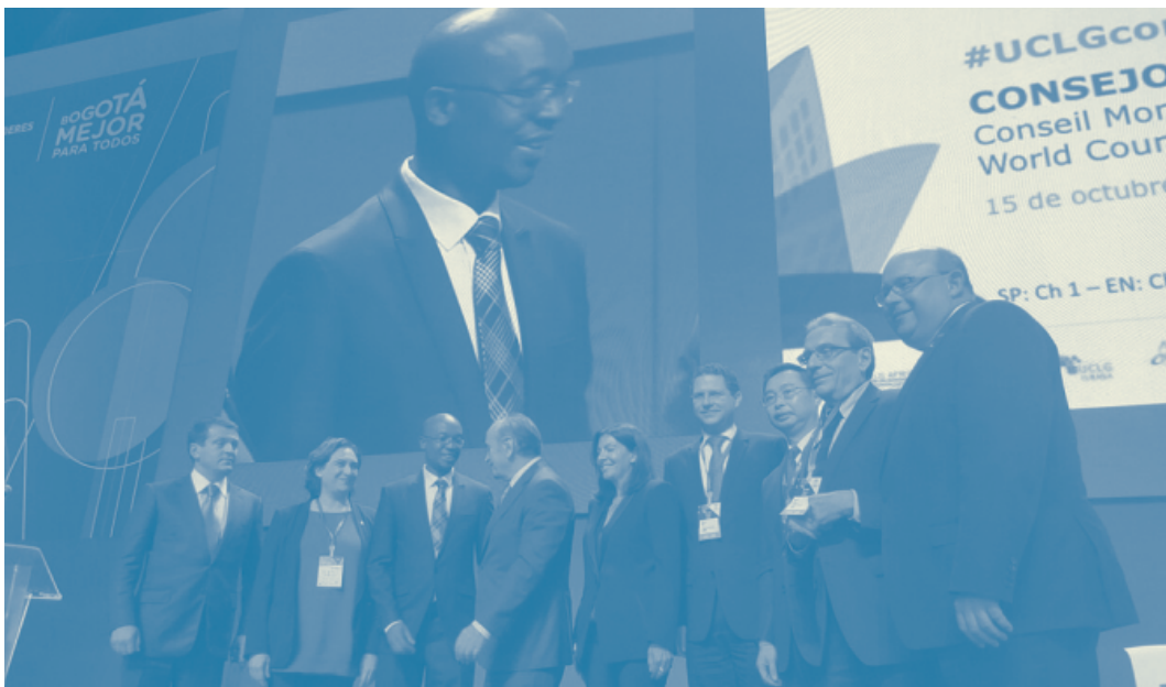
Mayor Ada Colau at the fifth UCLG Congress held in Bogota in October 2016, where she was chosen as co-chair of the network.

Emphasis should similarly be placed on the work performed within the context of Eurocities, the main organisation of cities at the European level, in areas such as the European Pillar of Social Rights and the right to housing, and MedCités, to promote Euro-Mediterranean cooperation. Mayor Ada Colau chairs the IAEC and was chosen as co-chair of UCLG in 2016 and of Metropolis in 2017.