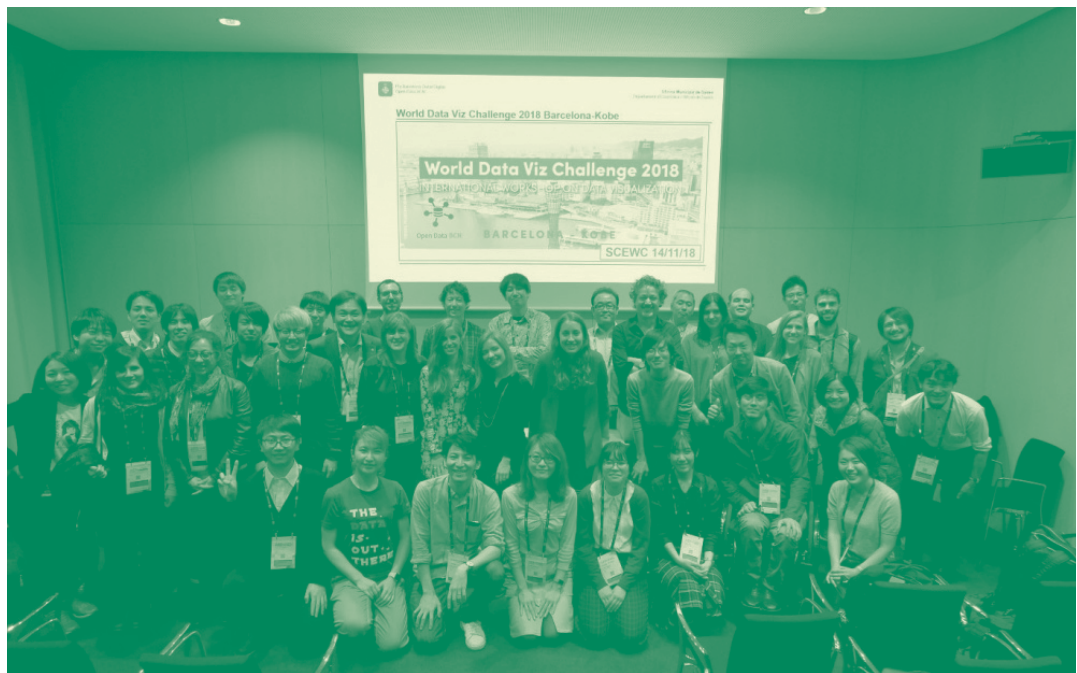
Finalists in the World Data Viz Challenge 2018 Barcelona-Kobe.

Similarly worthy of note is the work that the Department of International Relations performs with Casa Asia, and its contribution for basing the consortium in the 22@ district in 2018, thereby fostering an image more closely linked with urban, economic and social innovation. Meanwhile, thanks to collaboration by the Department of International Relations, the 2018 edition of the Asia Inno-va gathering organised by Casa Asia was held at Barcelona City Council, facilitating cooperation and exchange with Asia in terms of innovation and technology through notable representatives from this continent.