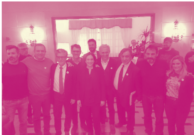
Mayor Ada Colau in Rome with mayors and representatives of various Italian cities and maritime rescue NGOs. February 2019.