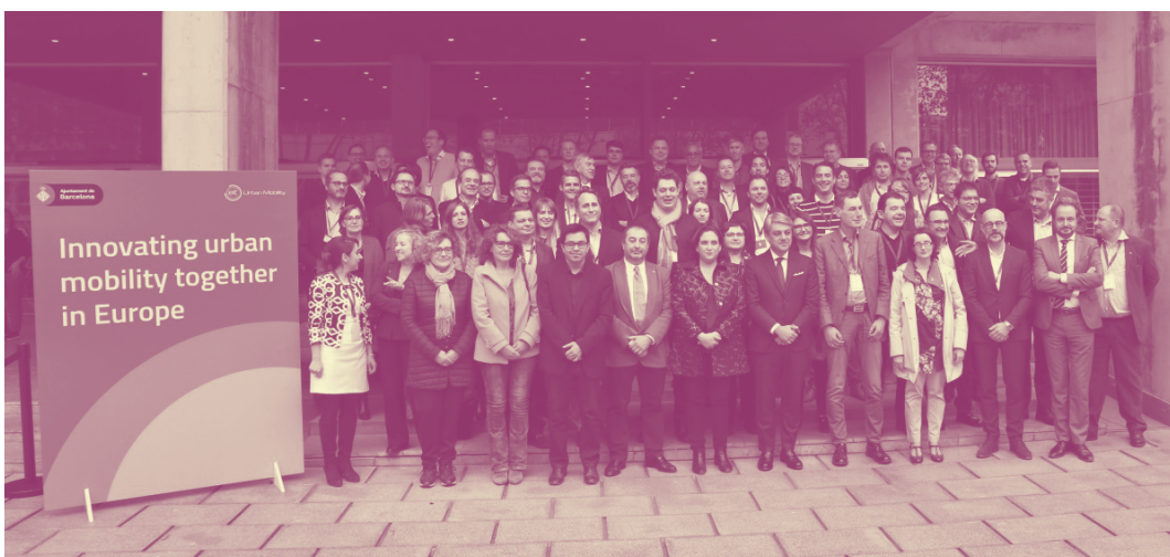
Mayor Ada Colau with the participants at the first EIT Urban Mobility General assembly, held in Barcelona in December 2018.

A final mention should be made of the project "Climate adaptation at the blue, green and grey schools", which was awarded 4 million euros in 2018 under the third Urban Innovative Actions (UIA) funding round, and plans to work with schools on a package of measures to create climate shelters.